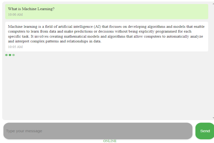
Fig.2 Add input and it will display output for given input.