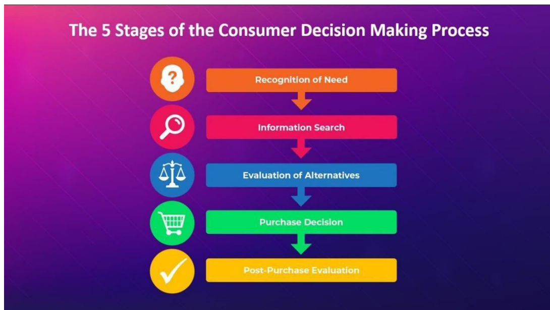
Fig.2 Phases of a purchase decision-making process

Carefully considering the stages of purchasing (Omar & Atteya, 2020) can be a problem-solving task for youth regarding their decision to buy a good or service. They go through several stages in this effort to achieve the desired result. Therefore, the buying process begins long before the actual purchase and has effects for a very long time. There are generally five basic phases to making buying decisions, although customers can skip some of them when making small purchases. Below is the buying process cycle: