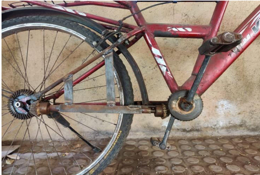
Figure 3: Working model