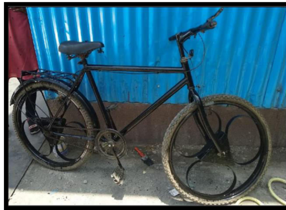
Fig 9.1 Loop Wheel bicycle

In this project we will design and fabricate a loop-wheel bicycle which will be able to have extra feature of shock absorption and also the better load bearing capacity. The project will contain a bicycle with an improved wheel. The wheel will be replaced from conventional spoked-rim system to leaf spring or loop spring. The wheel will consist Axle, Hub, Rim, Tyre and Leaf/loop springs. All parts will be mounted in wheel so as to maintain its center of gravity.