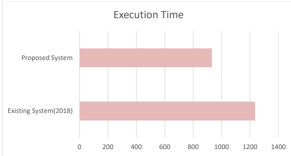
Figure 3: overall system execution graph