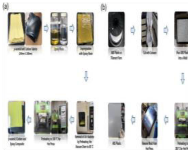
Fig. 1. (a) Manufacturing processes of the fiber-reinforced composite material; (b) Manufacturing processes of the ABS plastic.