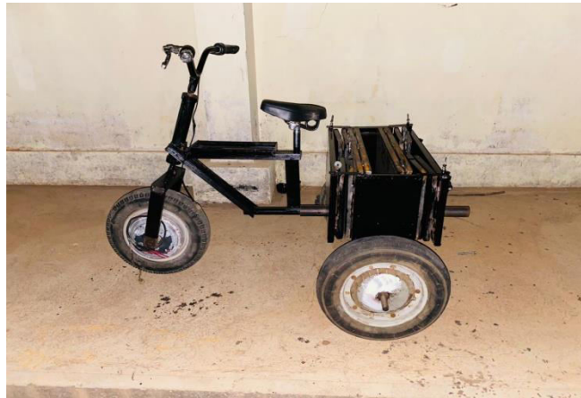
diagram of vehicle after folding