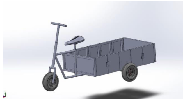
Normal diagram of vehicle