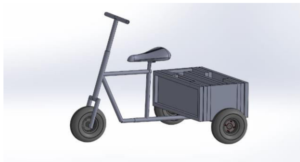
Diagram of folded vehicle