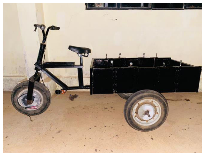
diagram of vehicle before folding

Finding alternatives to vans or trucks for deliveries in congested areas can improve efficiencies, and therefore business costs, for delivery companies; it can also reduce emissions from urban freight and help reduce congestion on streets to help people and goods move faster through our cities. Improving goods movement in Toronto through cycle logistics will bring the following benefits.