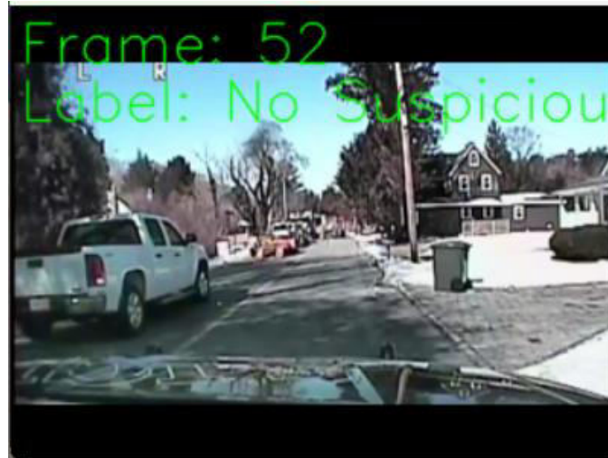
Fig2: No Suspicious Activity