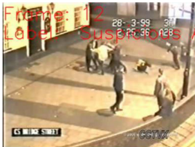
Fig 3: Suspicious Activity