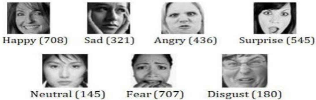
Figure 2 – Dataset Information

function in output layer for seven emotion classification. Input image size is adjusted to that 128*128*3. Furthermore, it is concatenated and passed through one more soft max layer for emotion classification and all procedure is same as above.