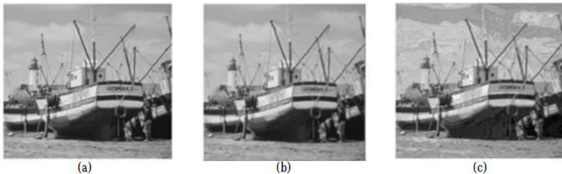
Fig.1. (a) original image, (b) blurred image, (c) deblurred image by inverse filter

Inverse filtering, on the other hand, can be extremely noise-sensitive and can amplify any noise that was already present in the degraded image, producing a noisy restored image. Researchers have suggested several inverse filtering modifications, including regularization and constraint-based techniques, to address this issue.