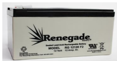
Fig.2 DC BATTERY