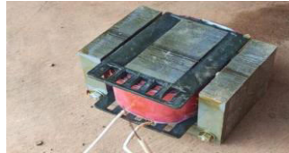
Fig.4 ELECTRO MAGNETIC COIL

The key to understanding the role of permanent magnet's gear shifting lies in the general issue of biasing. Consider the simplest magnetic as shown in the figure, but omit the lower electromagnet