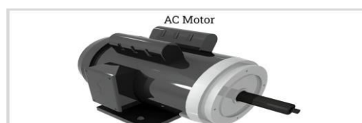
Fig.1 AC MOTOTR

Voltage - 200/220V; Frequency - 50HZ,1PH P; AMPS - 2 AMPS; Power - 0.25 HP; RPM -1420; KW-0.18