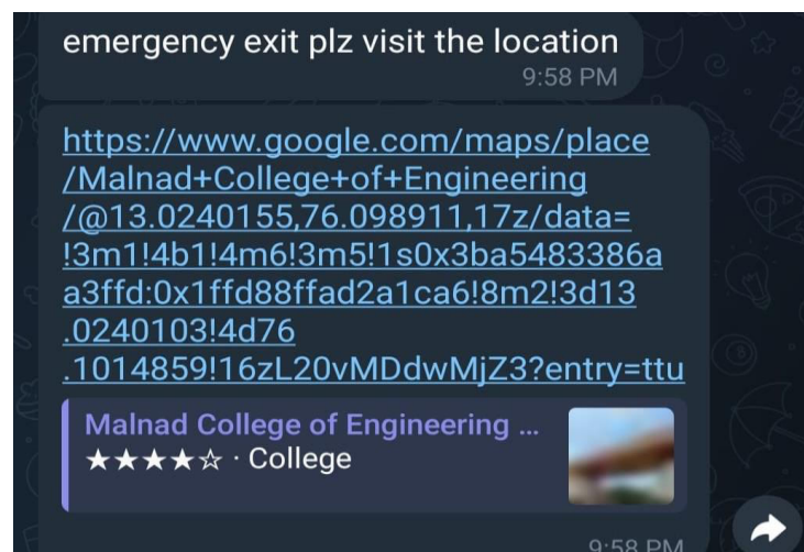
Fig: Screenshot of alert message