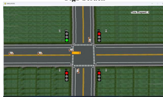
Fig2-Traffic Light -1