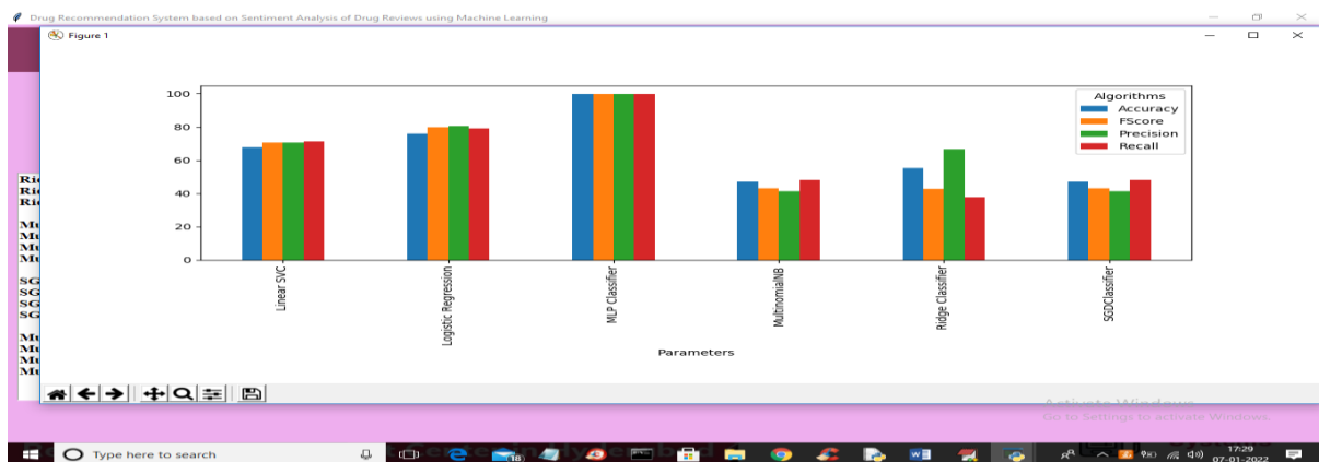
Figure 3: Precision recall and FS score

The term frequency – inverse document frequency (TF-IDF), BAG of WORDS, and WORVEC feature extraction algorithms have all been utilized by the author of this paper. Machine learning algorithms like Logistic Regression, Linear SVC, Ridge classifier, Nave Bayes, Multilayer Perceptron classifier, and SGD classifier will all make use of these features. We are combining the preceding algorithm with the TF-IDF features extraction algorithm due to its superior performance.