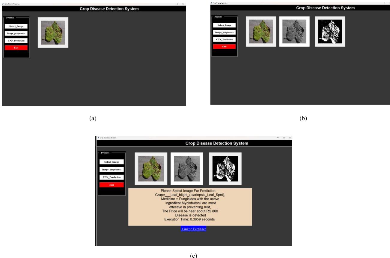
Fig. 2. Plant Disease Detection (a) Selection of Image (b) Image Pre-processing Done (c) CNN Prediction to Find Plant Disease and Fertilizer Price with Link to Website.

We implemented a system for plant disease detection and fertilizer recommendation that follows a systematic workflow. Initially, we selected an image of a diseased leaf from our dataset. The image underwent pre-processing steps, including resizing, normalization, and augmentation, to prepare it for input into our Convolutional Neural Network (CNN) model.