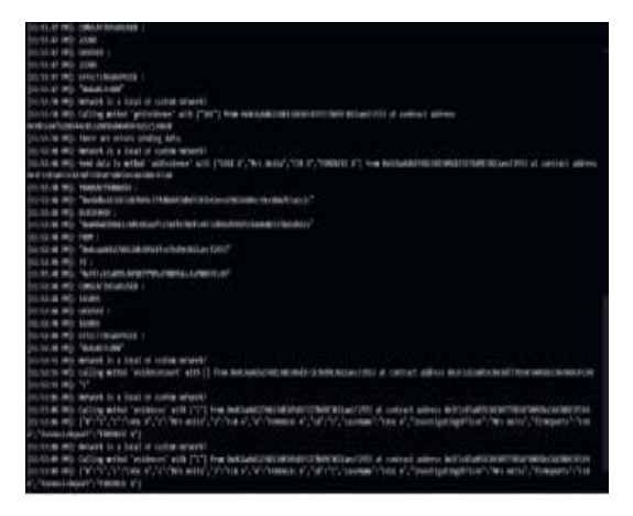
Fig 10:- Evidence added to Blockchain.

Evidence Room Staff after accessing their page can maintain the database of visitors to Evidence room by registering their details, also search evidence like which locker no it is stored in Evidence room through Evidence Id and generate Fir Report too.