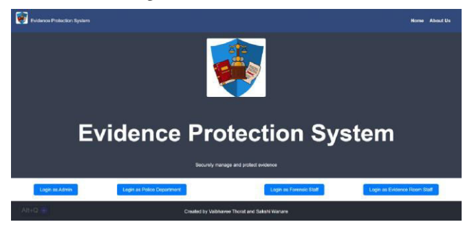
Fig 2:- Main Web Page

Model starts with website named "Evidence Protection System" which has four options :- Login as Admin, Login as Police Department, Login as Forensic staff, Login as Evidence Room Staff.