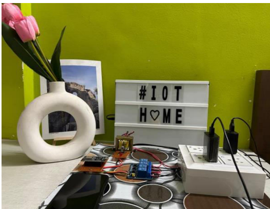
Fig a : Exemplar of System

Figures shows the result of the IOT (Wi-Fi) Based Home Automation System. Fig ‘a’ shows the overall exemplar of the system. Fig ‘b’ shows the interface of the application used to control the framework whereas Fig ‘c’ depicts the exemplar when executed.