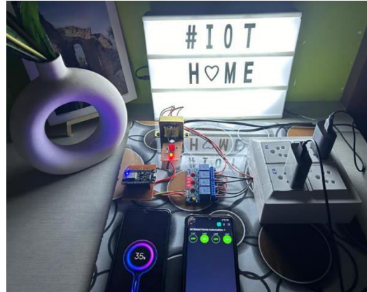
Fig c : Executed exemplar