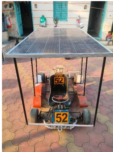
Fig. 1 Hardware of System

In the fig 1, it shows the Hardware model of the existing system.