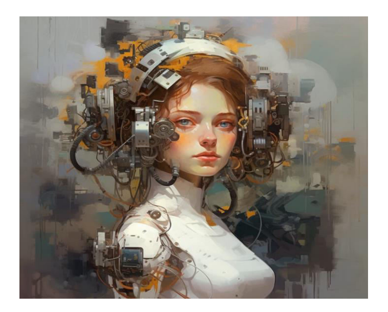
Fig no. 4- Intersection of creativity and technology