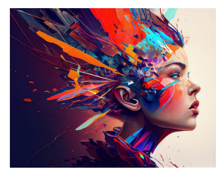
Fig no. 3-AI in art and design