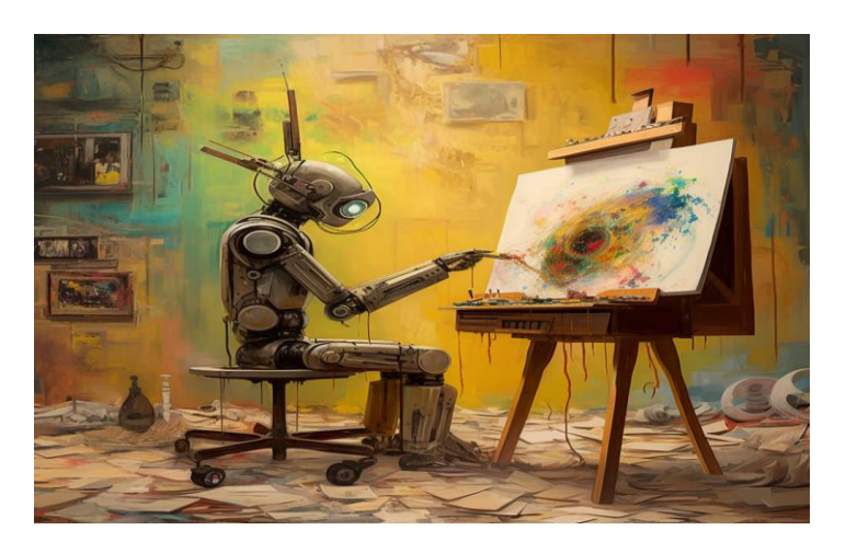
Fig no. 1- AI and art