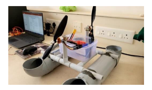
Fig.6. Outcome Photograph

Experimental trials confirmed the Unmanned Surface Vessel's (USV) remarkable manoeuvrability in simulated sewer environments, adeptly navigating narrow passages and circumventing obstacles. Gas detection trials validated the USV's capability to detect and quantify toxic gases like hydrogen sulphide (H2S), methane (CH4), and ammonia (NH3) in real-time, enabling proactive hazard response. Endurance testing demonstrated sustained performance over extended missions, supported by a rechargeable lithium-ion battery pack. LabVIEW-based data visualization facilitated intuitive remote operation and analysis of sensor data, revealing gas concentration trends. The USV exhibited high reliability and robustness, promising effective deployment in sewer infrastructure management for leak detection and environmental risk assessment.