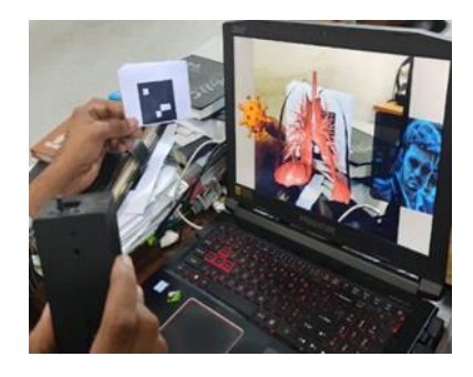
Fig 3: Output of Digital Twin Health Care in Abnormal Condition