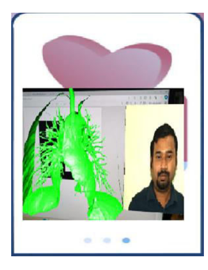
Fig 2: Output of Digital Twin Health Care in Normal Condition

|| Volume 13, Issue 5, May 2024 || | DOI:10.15680/IJIRSET.2024.1305151 |