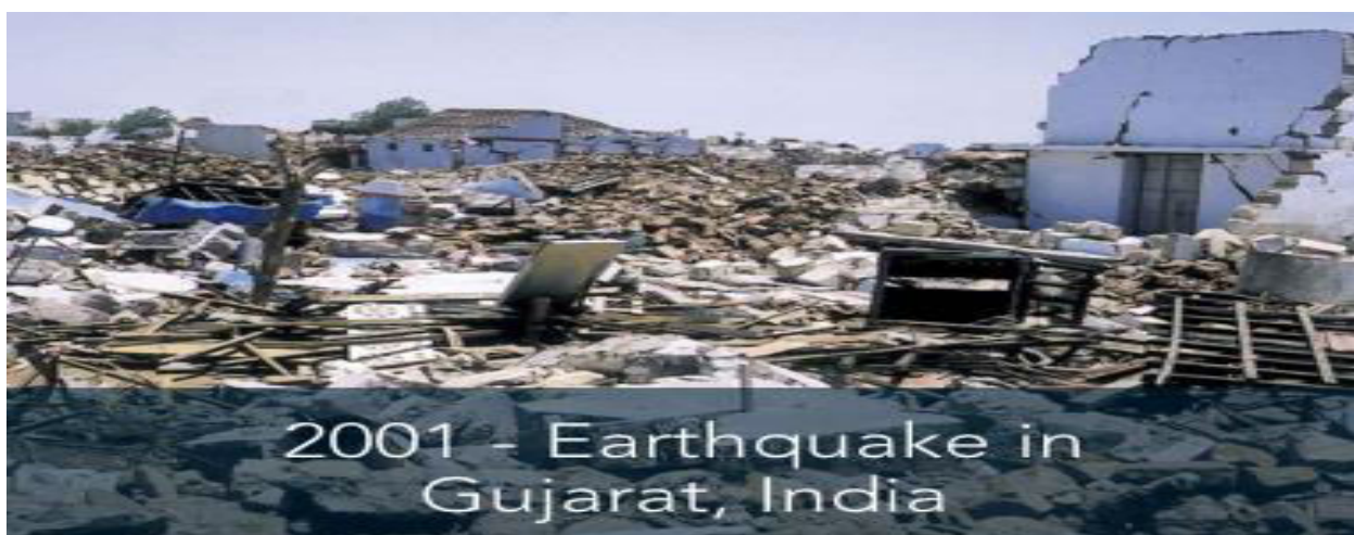
Fig.1 Earthquake in Gujarat, India

With multiple significant earthquakes documented over the ages, Gujarat has a long history of seismic activity. On January 26, 2001, a catastrophic earthquake struck the Kutch area, with its epicenter close to the town of Bhuj. With a 7.7 magnitude earthquake, hundreds of people died and a great deal of infrastructure, such as roads, bridges, and buildings, was severely damaged.