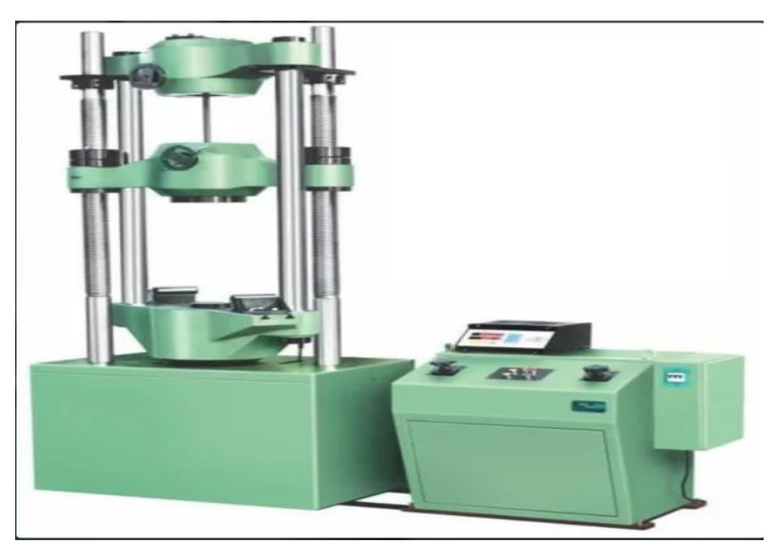
Fig.4 Universal Testing Machine