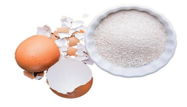
Fig. 2 Egg Shell Powder

|| Volume 13, Issue 5, May 2024 || | DOI:10.15680/IJIRSET.2024.1305163 |