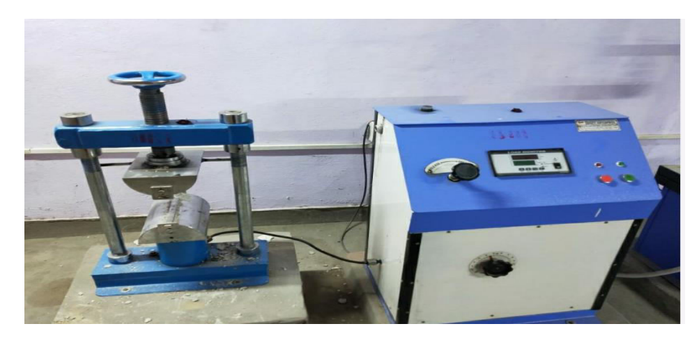
Fig.5 Split Tensile Strength Test Machine

Table 8 Split Tensile Strength of Concrete Cube