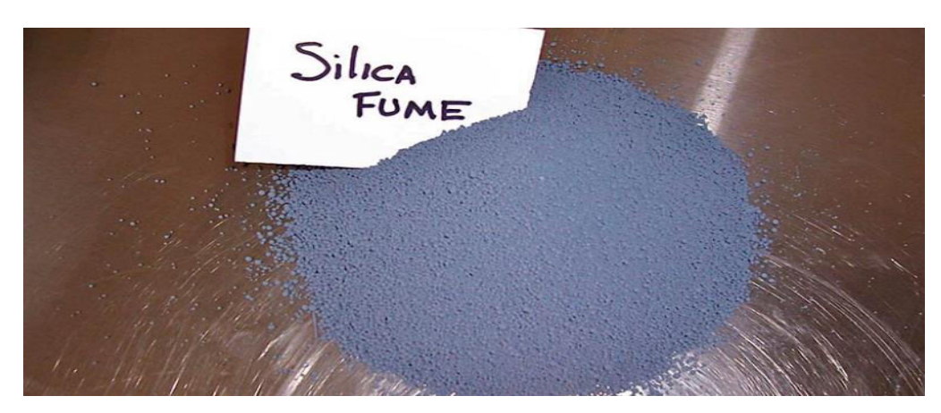
Fig1 Silica Fume

The calculation of silica fume has presented to improve both and toughness of concrete and compressive strength Also, the presence of this admixture has been shown definite in snowballing the electrical resistivity and the durability of concrete bare to aggressive situations like chloride comprising environments. Pozzolanic materials are usually able to association with the hydrated calcium hydroxide starting the hydrated calcium silicate which is the principal responsible for the benefit of hydrated cement pastes. Also, a rise in the bulk density of concrete fallouts as the mixture voids are occupied with very small admixture elements. The addition of silica fume in concrete leads to decrease in porosity of the evolution zone between matrix and aggregate in the renewed concrete and delivers the microstructure desirable for a robust transition zone. Hence, silica fume is extra with egg shell powder in the cement to recover the strength and durability parameter of the conventional mortar cubes. Silica fume is replaced by 5%, 10% and 15% by the weight of cement .