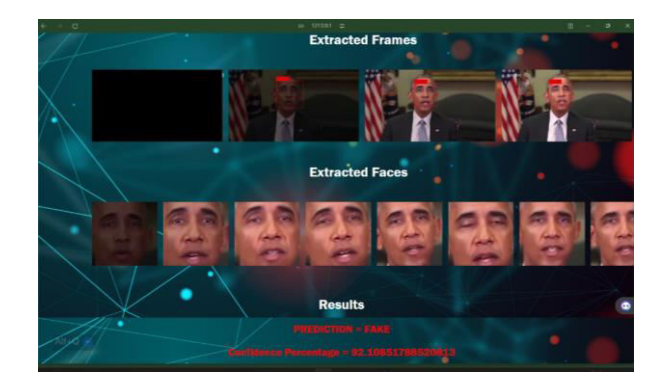
Fig. 4 illustrates model predictions for deep fakes based on pattern features and image anomalies,

The model was trained for 30 epochs, and accuracy and loss curves were plotted for both training and validation data. Training accuracy and validation loss were observed to be higher than validation accuracy and training loss, respectively. Loss values, calculated using the binary cross-entropy function, indicate the overall performance of the model. The classification task is binary, with "0" representing "fake" and "1" representing "real". Analysis of TP, TN, FP, and FN values indicates effective model performance. Precision and F1 score are calculated as 81% and 91%, respectively, indicating high performance. The model has learned to detect anomalies in fake images caused by upsampling techniques. Dropout layers were used to prevent overfitting, resulting in effective model performance with minimal accuracy divergence.