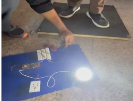
Figure 7: Working of model

Street lights can be provided electricity utilizing this strategy.