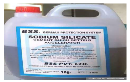
Fig 3 sodium silicate

Sodium silicate, with a Na2O to SiO2 ratio of 2.0, serves as a bonding agent in geopolymer concrete, sourced from detergent and textile firms. The solution is characterized by a density of 52Be and contains Na2O and SiO2 concentrations of 13.50% and 31.50%, respectively. The Na2O to SiO2 ratio stands at around 1:2.30, while the overall solid content constitutes 47%.