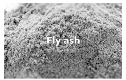
Fig 4 flyash