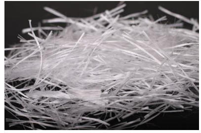
Fig 7 Fibers