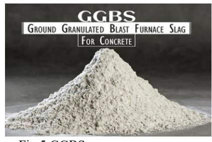
Fig 5 GGBS MIX DESIGN FOR GEOPOLYMER CONCRETE

Ground granulated blast furnace slag (GGBS) is a byproduct originating from the iron industry. During iron production, a mixture of iron ore, coke, and limestone is heated in a furnace, resulting in molten iron and a floating slag layer at temperatures around 1500oC to 1600oC. The molten slag typically contains 30-40% silicon dioxide (SiO2) and approximately 40% calcium oxide (CaO), like ordinary Portland cement (OPC) in chemical composition. Once the molten iron is removed, the remaining slag, rich in siliceous and aluminous residues, is rapidly cooled by water quenching. GGBS is produced by quenching the molten iron slag with water, forming a glassy granular substance. This granulated slag is then dried and finely ground into a powder, resulting in ground granulated blast furnace slag. GGBS exhibits a specific gravity of 2.7.