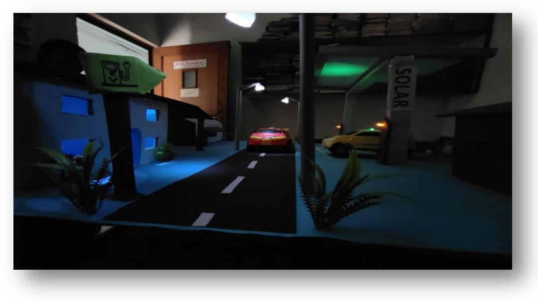
Figure 3. Photographs of Experimental Setup