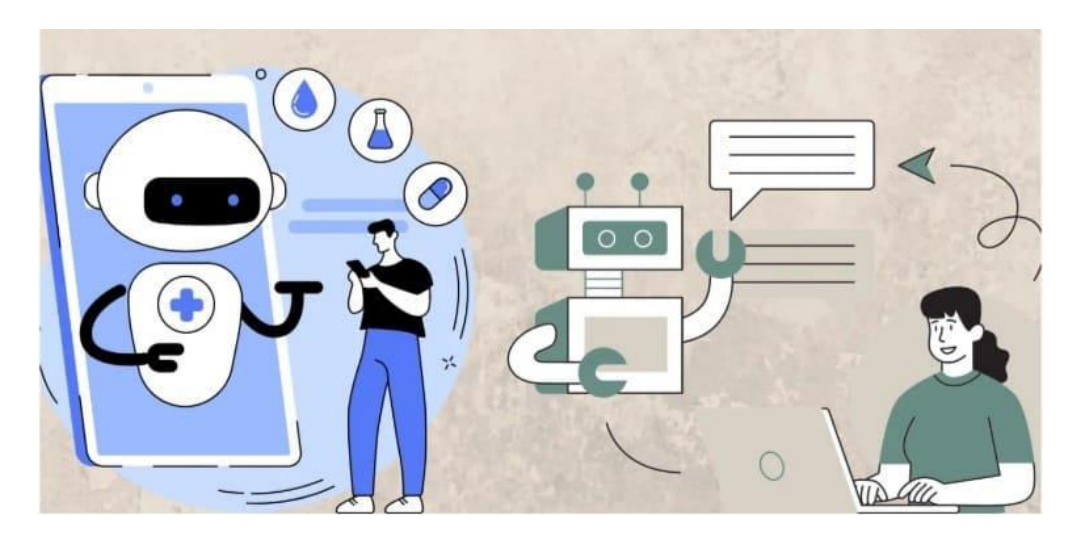
Fig. 5. Benefits of Using AI-Powered Chat Bot for Business