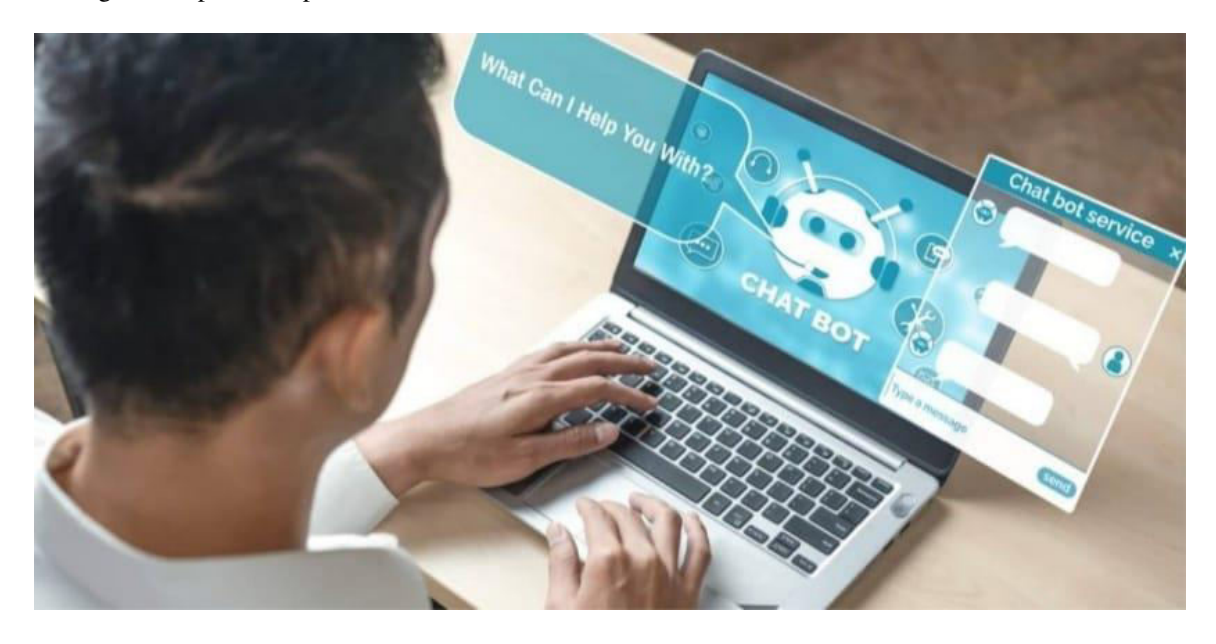
Fig.1.Chat Bot Service

By achieving these objectives, this research paper aims to provide valuable insights, guidelines, and recommendations for businesses, CX professionals, and technology stakeholders interested in leveraging AI chatbots to enhance customer experiences and drive business success on CX platforms.