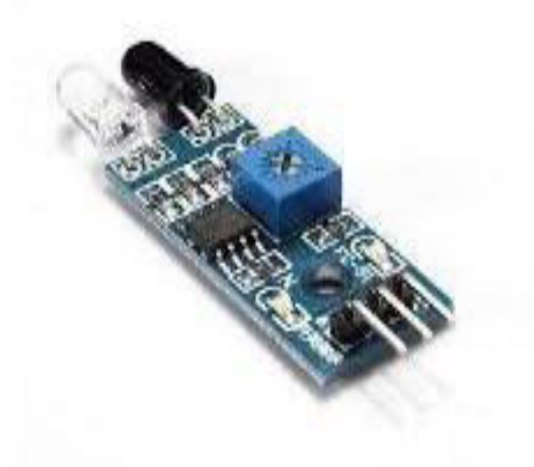
Figure 1 IR sensor

Here IR sensor checks whether the person has head covering or not once the vehicle has been started and if the person is not where the helmet it intimate the person to wear the helmet by indicating an LED and a alert message.