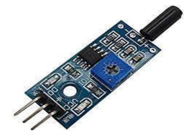
Figure 5 Vibration sensor

Vibration sensor is used to detect whether the accident has happened or not. At the same time the message will be sent to the authorized person and rescue system management through the GSM Module