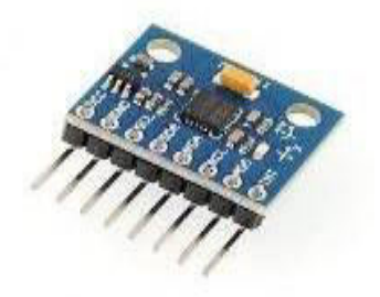
Figure 4 Gyroscope sensors

The message shows the angle of the person standing or lying after the accident.