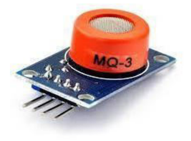
Figure 3 Alcohol sensors

This alcohol sensor is used to detect the driver's alcohol consumption status. If the person is consumed alcohol the vehicle won't start and it will be indicated by led red, green depending upon the consumption level.