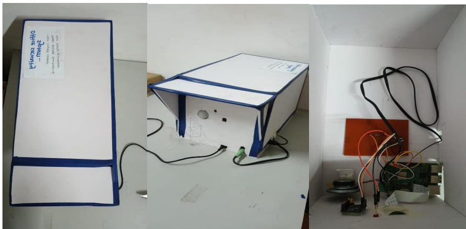
Fig.a. Office Security System hardware model