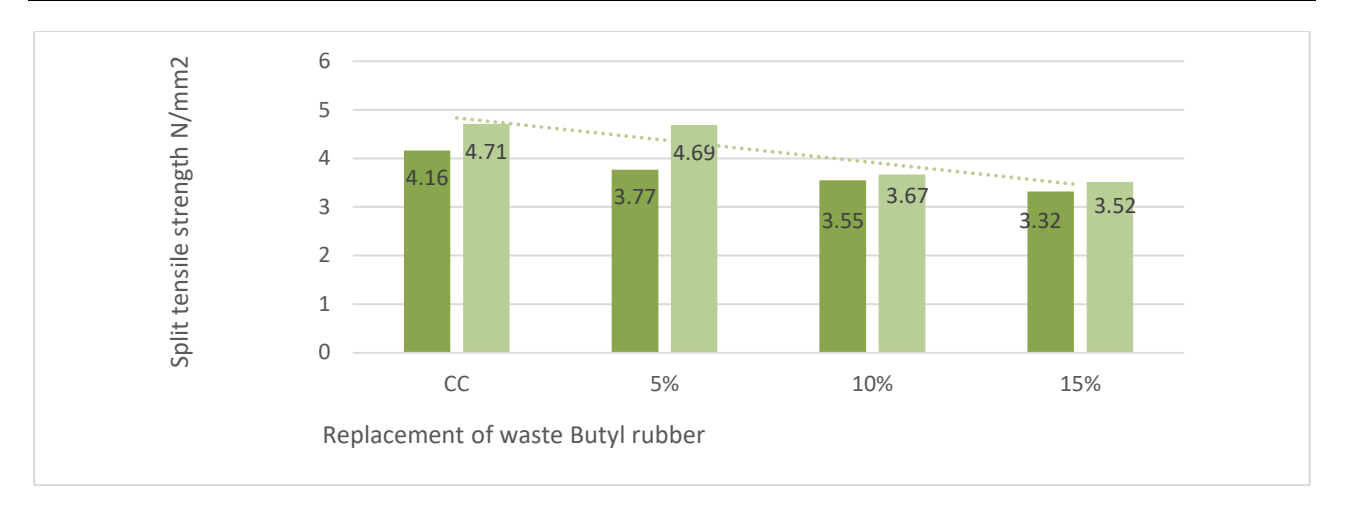
Figure 2. Graphical representation of Split tensile strength test at 7 and 28 Days

Flexural strength of the specimens were tested in (UTM) of capacity 1000 kN. The prism was casted in the size of 500x100x100mm. The load was given to the sample by two point load method. In each percentages of waste rubber tyre M30 grade was determinated at 7 & 28 days.