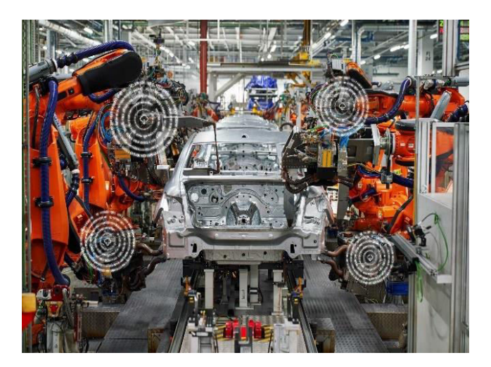
Fig (3): Maintaining product-based industries

Problem Context: Describe the specific maintenance challenges or problems faced by the manufacturing industries in each case study. This could include issues related to equipment breakdowns, unplanned downtime, maintenance scheduling, or resource allocation.