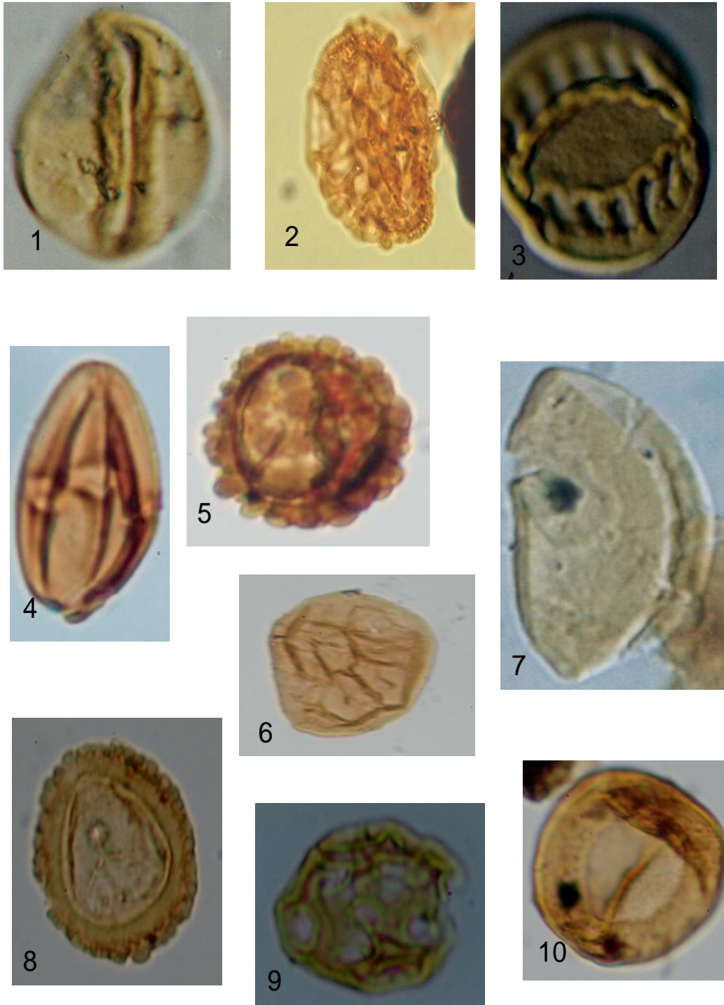
1. Monocolpites marginatus 2, Peregrinipollis nigericus ,3 Hexpollenites chmurae , 4 Tricolporate sp. 5. Distaverrusporites simplex ,6 Zlivisporis blanensis , 7 Longaperites microfoveolatus ,8 Cingulatisporites ornatus 9. Cretacaeiporites scabratus , 10 Graminidites annulatus