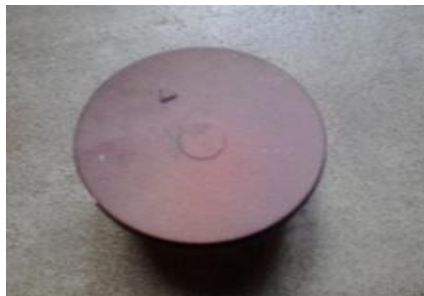
Figure 2 After Copper Coating