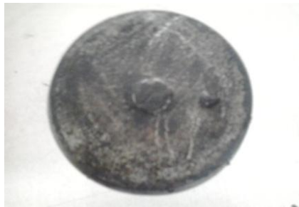
Figure 1 Before Copper Coating