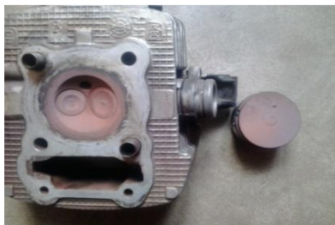
Figure 3 Coating on Piston Crown and Cylinder Head Bottom