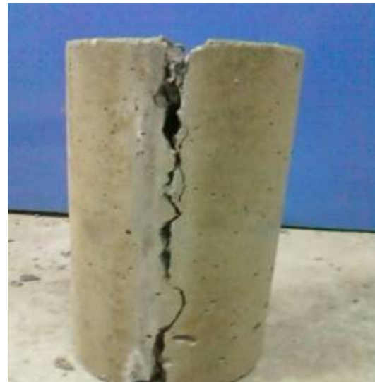
Fig. 3 Split tensile strength test

The split tensile strength of M30 mix design using steel fibre @ 0.75% by volume of concrete is observed to be 4.30 MPa as compared to the ordinary concrete i.e.3.20 MPa which is 34.37% higher. The percentage increase of the split tensile strength of same mix design using glass fibre @ 2% by weight of cement at 28 days of water curing is observed to be 39.68% compared with the split tensile strength of ordinary concrete at 28 days. The increase in strength of Split Tensile strength of M30 grade concrete mix using black wire steel fibre @ 0.25%, 0.50%, 0.75%, 1.0%, and 1.25% by volume of concrete at 28 days is observed to be 13.12%, 22%, 31.25%, 35% and 37.50% respectively compared with Split Tensile Strength of ordinary concrete at 28 days of water curing. Use of black wire steel fibre reinforcement has higher strength gain upto 0.75% dose for compressive, tensile and split tensile strength.