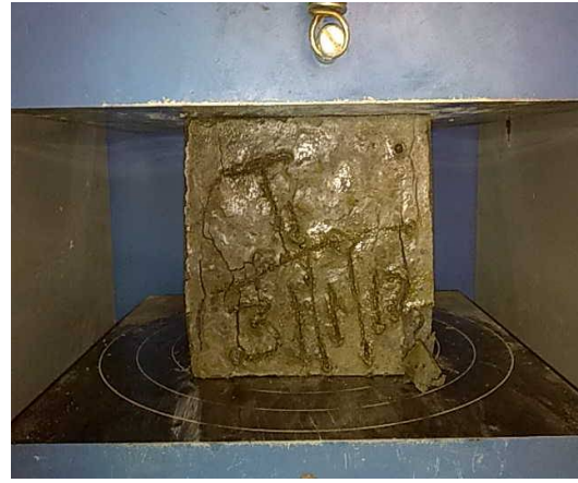
Fig. 1 Compressive strength test

The increase in Compressive Strength of M30 grade concrete mix using Steel Fibre @ 0.75 % by volume of concrete at 28 days is observed to be 20.50% when compared with 28 days strength of ordinary M30 grade concrete. Compressive strength of M30 grade of concrete mix using glass fibre @ 2% by weight of cement at 28 days had increase from 37.77 to 44.78 MPa which is 18.50 % higher compared with compressive strength of reference concrete at 28 days. The increase in compressive strength of M30 grade concrete mix using black wire fibre @ 0.25%, 0.50%, 0.75%, 1.0%, and 1.25% by volume of concrete at 28 days is observed to be 10%, 14.25%, 18%, 20.35% and 22% higher strength respectively as compared to the compressive strength of reference concrete at 28 days.