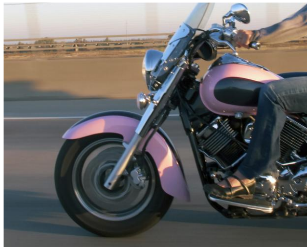
Figure 4. Although our society may have a stereotype that associates motorcycles with men, female bikers demonstrate that a woman’s place extends far beyond the kitchen in modern world.

Children learn at a young age that there are distinct expectations for boys and girls. Cross-cultural studies reveal that children are aware of gender roles by age two or three. At four or five, most children are firmly entrenched in culturally appropriate gender roles (Kane, 1996). Children acquire these roles through socialization, a process in which people learn to behave in a particular way as dictated by societal values, beliefs, and attitudes. For example, society often views riding a motorcycle as a masculine activity and, therefore, considers it to be part of the male gender role. Attitudes such as this are typically based on stereotypes — oversimplified notions about members of a group. Gender stereotyping involves overgeneralizing about the attitudes, traits, or behaviour patterns of women or men. For example, women may be thought of as too timid or weak to ride a motorcycle.[13]