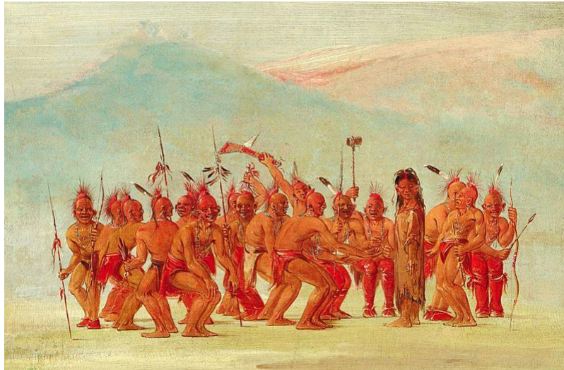
Figure 2. George Catlin (1796-1872), Dance to the Berdache. Catlin’s sketch depicts a ceremonial dance among the Sac and Fox Indians to celebrate the two-spirit person.

Sexuality refers to a person’s capacity for sexual feelings and their emotional and sexual attraction to a particular sex (male or female). Sexuality or sexual orientation is typically divided into four categories: heterosexuality, the attraction to individuals of the opposite sex; homosexuality, the attraction to individuals of one’s own sex; bisexuality, the attraction to individuals of either sex; and asexuality, no attraction to either sex. Heterosexuals and homosexuals may also be referred to informally as “straight” and “gay,” respectively. According to current scientific understanding, individuals are usually aware of their sexual orientation between middle childhood and early adolescence (American Psychological Association, 2008). They do not have to participate in sexual activity to be aware of these emotional, romantic, and physical attractions; people can be celibate and still recognize their sexual orientation. Homosexual women (also referred to as lesbians), homosexual men (also referred to as gays), and bisexuals of both genders may have very different experiences of discovering and accepting their sexual orientation.[6] At the point of puberty, some may be able to claim their sexual orientations while others may be unready or unwilling to make their homosexuality or bisexuality known since it goes against North American society’s historical norms [5]