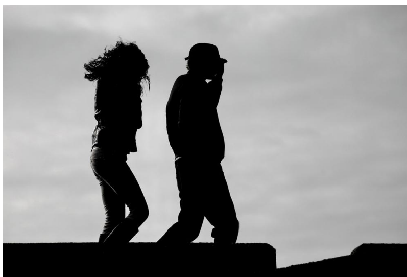
Figure 1. While the biological differences between males and females are fairly straightforward, the social and cultural aspects of being a man or woman can be complicated.

reproductive system) and secondary characteristics such as height and muscularity. Gender is a term that refers to social or cultural distinctions and roles associated with being male or female. Gender identity is the extent to which one identifies as being either masculine or feminine. As gender is such a primary dimension of identity, socialization, institutional participation, and life chances, sociologists refer to it as a core status.[2]