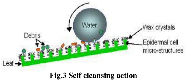
Fig.3 Self cleansing action

Research is being carried out on the application of nanotechnology to glass, another important material in construction. Titanium dioxide (TiO_2) nanoparticles are used to coat glazing since it has sterilizing and anti-fouling properties. The particles catalyze powerful reactions that break down organic pollutants, volatile organic compounds and bacterial membranes. TiO2 is hydrophilic (attraction to water), which can attract rain drops that then wash off the dirt particles. Thus the introduction of nanotechnology in the glass industry incorporates the self-cleaning property of glass.