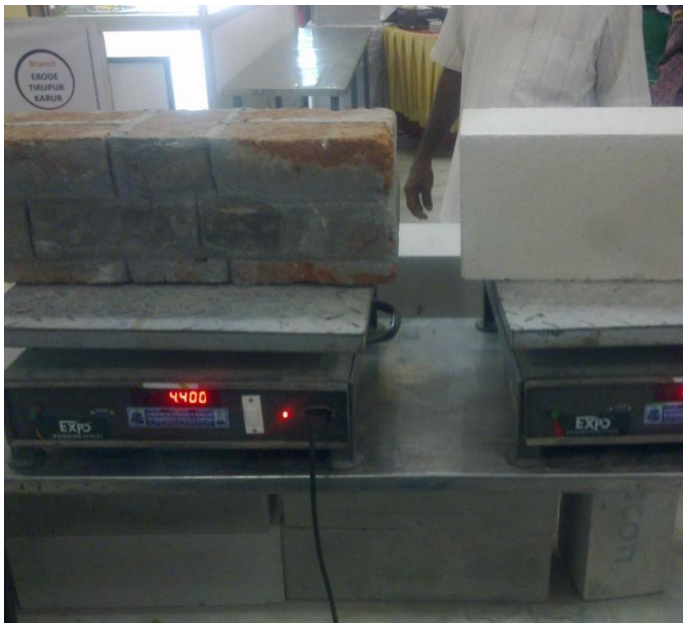
Figure: 1.2 lesser weight than bricks