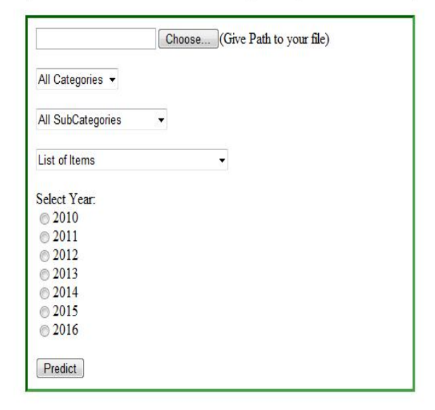
Figure Data Entry Page

Copyright to IJIRSET www.ijirset.com 418