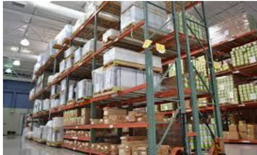
Fig.4. Materials in stores