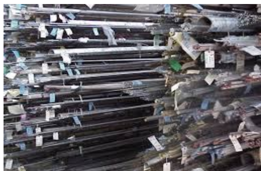
Fig.1. material in stock yard

Transport of materials is considered as one of the non value added activity. It also damages the materials if it not safely handled, so long and unnecessary transport of materials should be avoided. This can be avoided by placing machines closer to each other. The raw materials are to be off loaded in and stored in a specified area. If there is not enough space at this area then the goods are offloaded and stacked at the available areas around the building. Sometimes this area is too far from the usage area. This results in damage of the materials due to improper storage of materials. These materials are transported to the required area by forklifts. The materials travel long distance if they are stored far away from the stock yard.