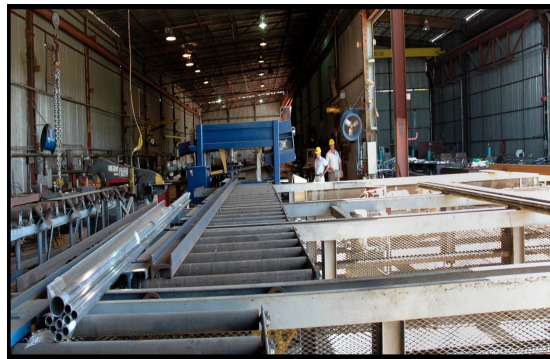
Fig.5. New material handling system