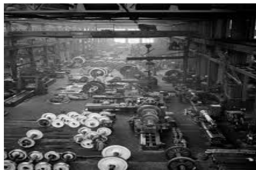
Fig.2. Materials waiting in machine shop

There are two different forms of waiting. One when the raw materials are not available at the required time both man and machines wait for the arrival of the materials. The second form is when the materials are available but the machines got breakdown, or the man is absent then the materials wait for the machines to get ready or for the available of man.