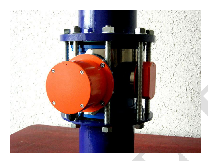
Fig. 3. The microwave sensor "A-344" in composition of pipeline

(An ISO 3297: 2007 Certified Organization) Vol. 3, Issue 11, November 2014