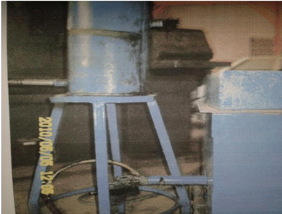
Plate 1: A complete assembly of burner system