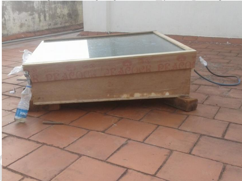
Figure 1:- Experimental setup

Typical solar system consists of wooden box and sheet metal tray. Top of the system is covered by glass in order to increase the solar intensity. Thickness of the sheet metal is 3mm and thickness of glass is 2 mm. Wood is used to minimize heat loss from the system. Evaporation and condensation is the process taking place. Salt water is filled in the system and allowed to get evaporated in sunlight. Temperature of inside water, outlet water and glass are measured at one hour once. Optimum evaporation is achieved at noon. Water vapor gets condensed in glass cover. Provision is made to collect the condensed distilled water. Quality of the water is analyzed using Water analyzer. Property of the distilled water quite matched with the process out let water. Experiment is carried out from 10.00 A.M to 4.00 P.M with time interval of one hour. Experiment setup is shown below in figure 1. Experiment is carried out in college campus in the month of August. It also repeated in month of April, where we get high solar intensity. The rate of evaporation is high in this month.