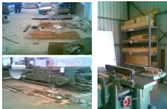
Fig.IV: 5S SEIKETSU APPLICATION AREA

Sri Krishna College of Engineering & Technology, Kuniamuthur, Coimbatore-641008, Tamilnadu, India