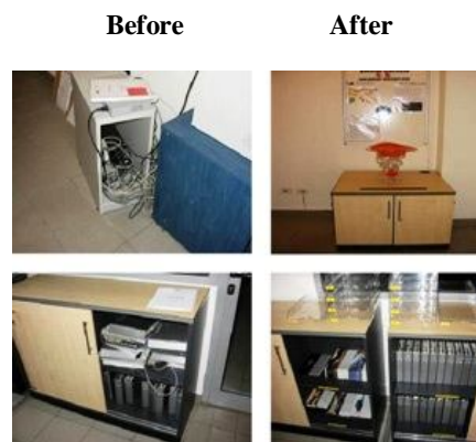
Fig. III: 5S SEISO APPLICATION AREA