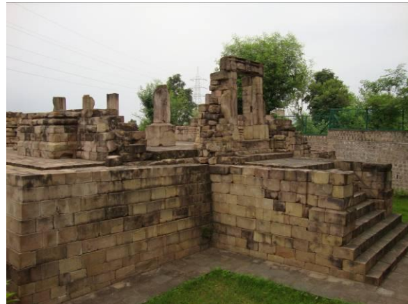
Fig (C): Front view of Kala Dera temple-I Fig (D): Side-Lateral view of Kala Dera temple-I

Microorganisms participate actively in the weathering of minerals [4]. Microbial processes leading to the degradation of mineral may include microbial oxidation and reduction, creation and maintenance of appropriate physicochemical conditions, and production of acidic metabolites [5]. These microbial-mediated processes are partially responsible for the chemical and physical weathering of rocks, which lead, eventually, to the formation of soils. Microorganisms may also contribute to the deterioration of stone artifacts such as historical monuments and statues. Most authors have tested acid production by isolated microorganisms in laboratory cultures, in the absence of the stone substrate, extrapolating these results to the field situation as well as climatic condition.