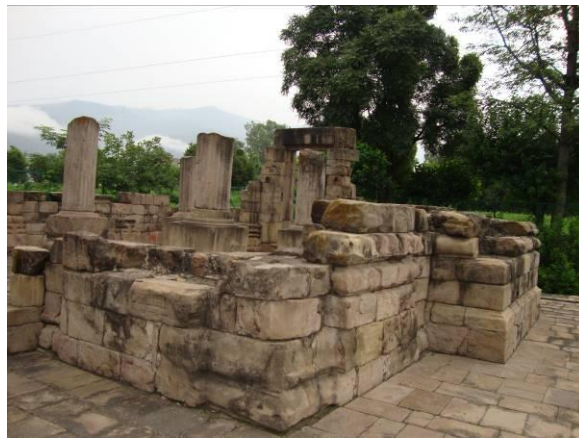
Fig (A): General view of Kala Dera temple-I Fig (B): Lateral view of Kala Dera temple-I