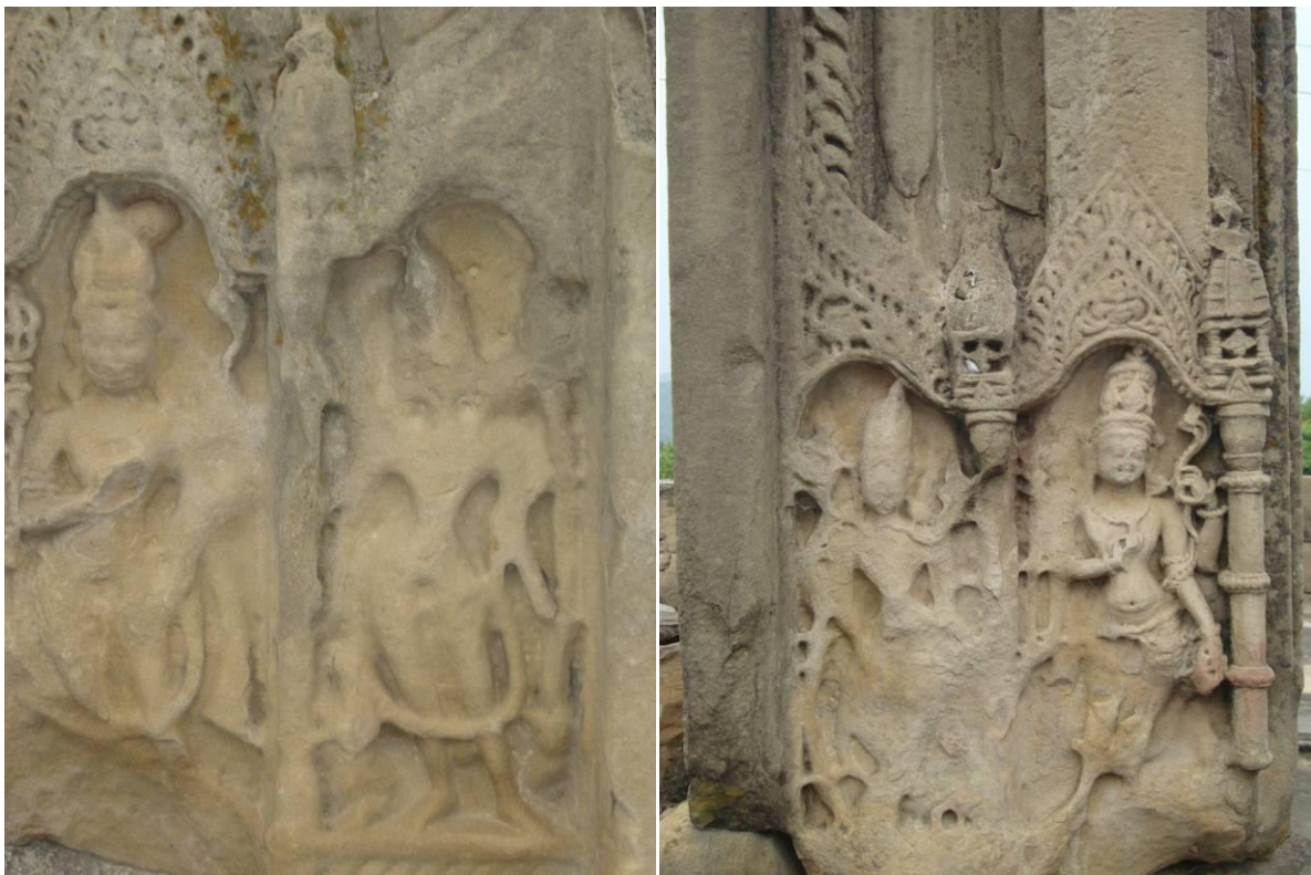
(E):Frazile Sculpture of Kala Dera temple-I (F): Deteriorated Stone structure of Kala Dera temple-I

It has also been shown in the laboratory that fungal species such as Aspergillus niger were able to solubilize powdered stone and chelate various minerals in a rich glucose medium because they produce organic acids such as gluconic, citric, and oxalic acids [13]. The toxic metabolites produced by various species of fungal organisms function as chelating agents that can leach metallic cations, such as Iron, Magnesium etc from the stone surface. Laboratory experiments have demonstrated that basic rocks are more susceptible to fungal attack than acidic rocks. In the present study Aspergillus are the most common species found in the sites. Aspergillus niger released certain metal ions from the rock samples[14].