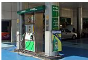
Ethanol pump station in Sao Paulo, Brazil

The largest single use of ethanol is as a motor fuel and fuel additive. The largest national fuel ethanol industries exist in Brazil (gasoline sold in Brazil contains at least 25% ethanol and anhydrous ethanol is also used as fuel in more than 90% of new cars sold in the country). The Brazilian production of ethanol is praised for the high carbon sequestration capabilities of the sugar cane plantations, thus making it a real option to combat climate change. Henry Ford designed the first mass-produced automobile, the famed Model T Ford, to run on pure anhydrous (ethanol) alcohol—he said it was "the fuel of the future". Today, however, 100% pure ethanol is not approved as a motor vehicle fuel in the U.S.