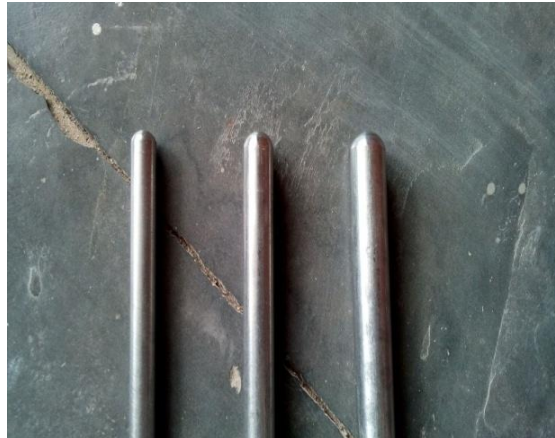
Fig.1. Tools used to conduct the experiment and deform the sheet

4. Experimental setup: The process starts from a flat sheet blank clamped on a fixture and mounted on the table of CNC machine. Then the forming is done with help of hemispherical tool shown in figure 1 to move over the surface of plate Hemispherical type forming tool with 8mm, 10mm and 12mm diameters were used as shown in figure 1. Also fixture with clamping system was designed and machined according to desirable dimensions shown in figure 2.