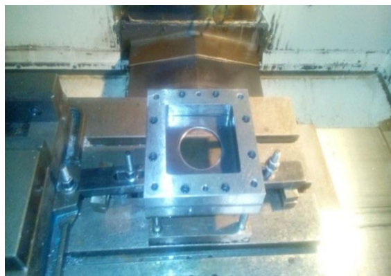
Fig.2. Fixture designed to hold the plate