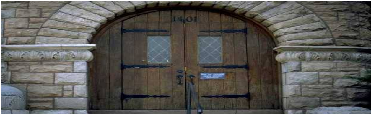
Figure 7: Use of arches in Lintels