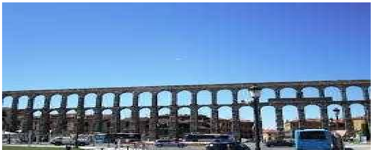
Figure 3: Segovia Ancient Roman Architecture