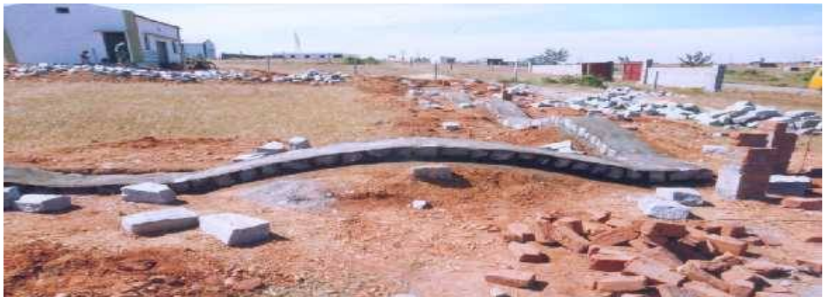
Figure 10: Construction of Arches in foundations