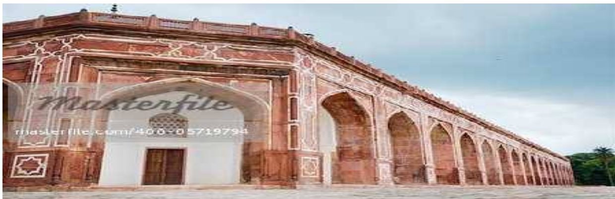
Figure 4: Ornamental arches of Humayun's tomb in New Delhi

Figure 4 shows the use of arches in exterior walls of the Humayun's tomb in New Delhi. The Humayun tomb of Indian architecture is located at the centre of a huge garden complex. In Vijayavittala temple of Hampi-Vijayanagara (Figure 5), stone masonry arches have been extensively used. The India Gate is a large arch, built in 1931. It is a war memorial to the Indian soldiers who died during World War 1 and the 3rd Anglo-Afghan War. The names of some 70,000 Indian soldiers who died in World War in "France and Flanders, Mesopotamia, Persia, East Africa and elsewhere in the near and the far-east" between 1914-19 are inscribed on this memorial arch. Figure 6 shows the Red fort Mogul Arch. The fort took nearly nine years to complete. Within the walled city, the fortress is in the shape of a rectangle 900 meters by 550 meters. The rampart walls are about 34 meters high. The main entrance to the fort is through the Lahori Gate. A covered passage with shops on either side leads to the palaces inside the fort. The uses of arches in the buildings for various purposes are shown in Figure 7 to Figure 8.