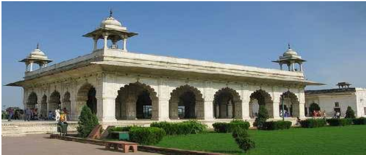
Figure 6: Red fort Mogul Arch