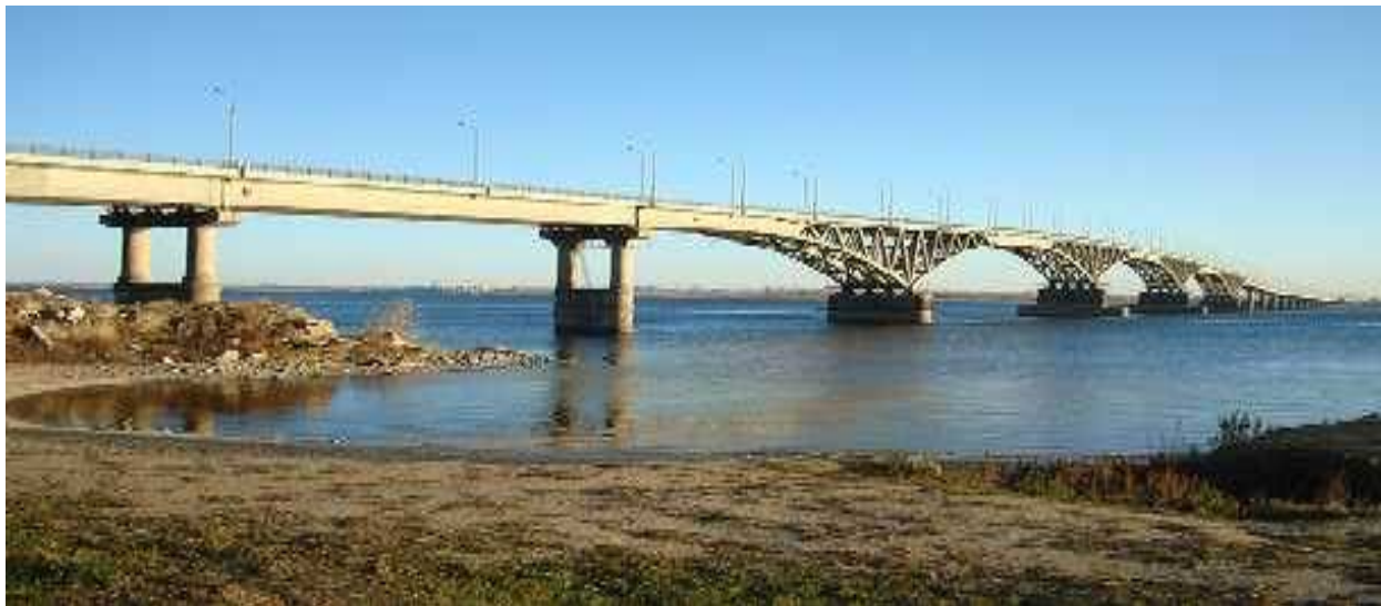
Figure 2: Saratov Arch Bridge, Russia

arches to a wide range of structures. The Egyptians used it in tombs and vaults but never for monumental architecture. The Greeks also used the arch solely for practical constructions, but many of the principles they developed were later exploited by the Romans. Saratov Arch Bridge across the Volga River in Saratov, Russia was the longest bridge in the Soviet Union and has been inaugurated in 1965. Its length is 2,803.7 meters and connects Saratov on the right (west) bank of the Volga, with the city of Engels on the left (east) bank. The bridge consists of 5 spans. It is shown in Figure 2. The aqueduct of Segovia is one of the world's best-preserved examples of Roman architecture. It runs through the center of Segovia in northern Spain. The aqueduct is 2,950 feet long, contains about 170 arches and rises 90 feet. Builders constructed the aqueduct with 20,400 granite blocks without using the mortar. The details are shown in Plate 1.3.