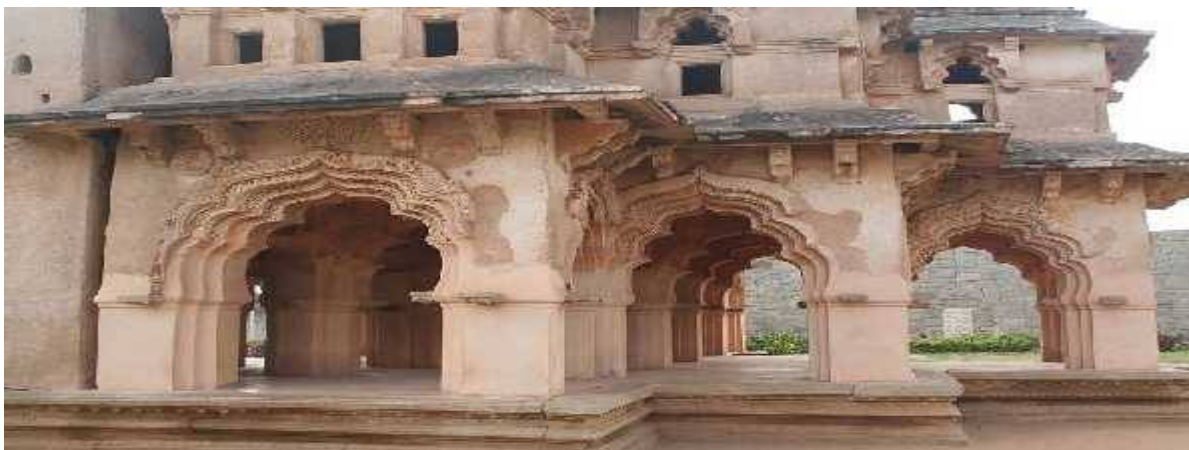
Figure 5: Hampi-Vijayanagara(thinkingparticle.com)