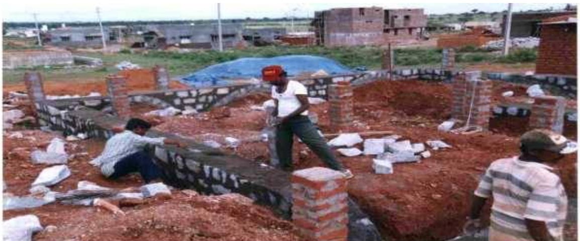
Figure 11: Construction of spandrel walls