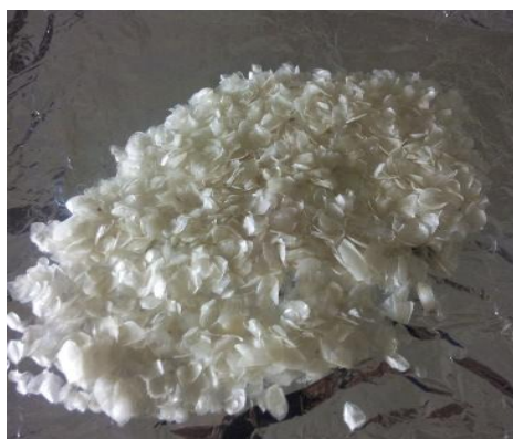
FIGURE 1 DRIED FISH SCALES

The extraction procedure generally involves the principle of pH-shift method. The dried fish scales were initially grinded well with 30% HCl of pH 1-2. After grinded well, they were subjected to the centrifugation process at 10,000 rpm for 15min. The supernatant obtained was then adjusted to the pH 9-10 by using 1N NaOH. The pH was again adjusted to neutral pH 7 using 0.1N HCl and again centrifuged at 10,000 rpm, 15min. The precipitated protein product was then collected and lyophilized.