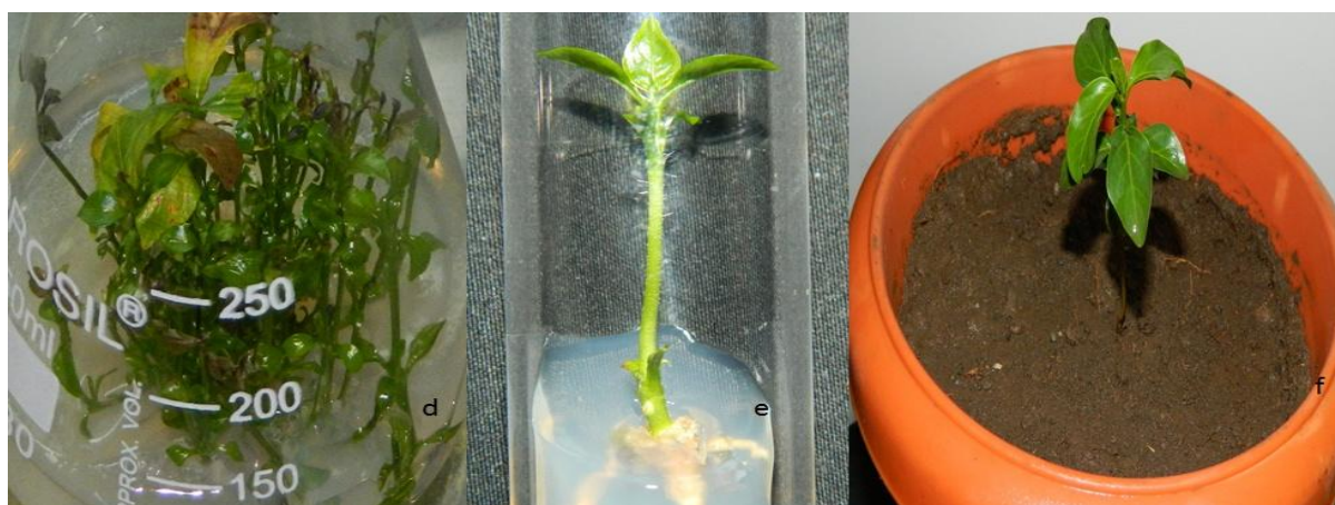
Fig. 2. (d) Development of shoots after four weeks. (e) In vitro regenerated roots. (f) Acclimatization of plantlets. The plantlet is successfully transferred to soil after hardening with a 70% survival rate. Acclimatization is the final step in a successful micropropagation system. During this stage plants have to adapt to the new environment of greenhouse or field. The plantlets usually need some weeks of acclimation in shade with the gradual lowering of air humidity [12].

NAA is widely used for induction of roots on regenerated shoots of medicinal plants like Adathodavasica [8], Hemarthriacompressa [9], Tavernieracuneifolia [10]. Similarly, IBA promoting rooting in Hebe buchananii (Hook) [11]. Direct multiple shoots were regenerated successfully and a single shoot was transferred on rooting media. 2- 3 cm long plantlet with 4- 5 leaves and roots then acclimatized successfully (Fig. 2).